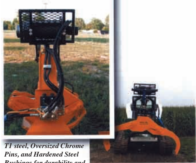
T1 steel, Oversized Chrome Pins, and Hardened Steel Bushings for durability and dependability.

The Model 6060 for larger size skid steers features heavy duty boom design with cradle supports inside and outside the frame to secure load when carrying the load straight away or cross ways and the standard push bar features dual purpose in pushing objects as well as protecting the attachment. Serrated edges along the sides of the frame stabilize the load when hauling horizontally and the inside serrated cradle stabilizes the load perpendicular without having to re-adjust your load for balance. Winch is Optional.