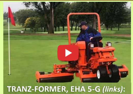
TRANZ-FORMER, EHA 5-G ( links ):

Product Page • Product Video Features & Specifications Benefits of Smoothing Sports Fields