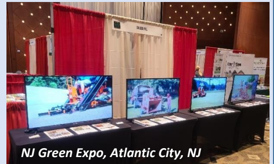
NJ Green Expo, Atlantic City, NJ

Tell your customers to plan and visit us at an upcoming show!