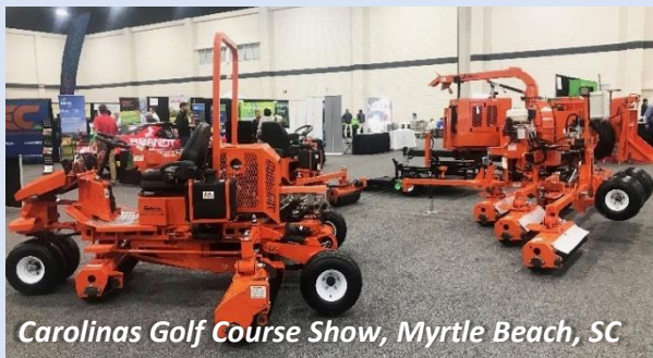
Carolinas Golf Course Show, Myrtle Beach, SC

It was great meeting all who stopped by our booth at these recent shows!