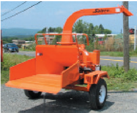
Model 8625, 25 HP, Kohler, Gas

Two (2), bed knives, one vertical and one horizontal enables chipping stringy material such as palm fronds and vines.