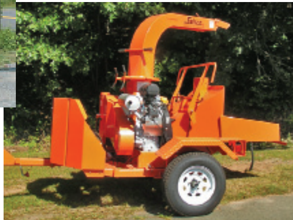
Model 8637, 37HP, B&S EFI, Gas

Two (2), bed knives, one vertical and one horizontal enables chipping stringy material such as palm fronds and vines.