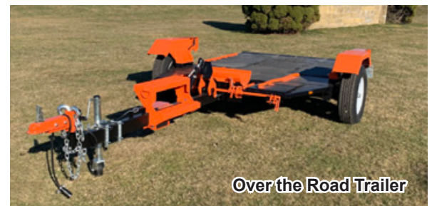
Over the Road Trailer

Self-Locking easy to load tilt trailers with rubber strips on the wooden deck (off the road trailer) are quickly and easily loaded for transport either over the road or off the road. Safety steps and handle bar provide easy access to the drivers seat.