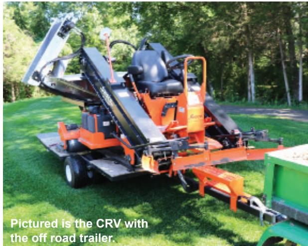
Pictured is the CRV with the off road trailer.

One person on the aerifier, one person on the dump vehicle, and one person on the CRV can complete any aerification project and no one picks up a shovel! Simply drive over the aerated area and let the guide blades feed the cores to the lift elevators. The cores are collected in the waste container and can be emptied as you drive or once the container is full. When not being used for core recovery simply remove the elevators, the waste container and waste conveyor and use the CRV to roll fairways, greens, approaches & sports fields. The 72" rolling swath makes this a time saving, labor saving & money saving unit, all year long!