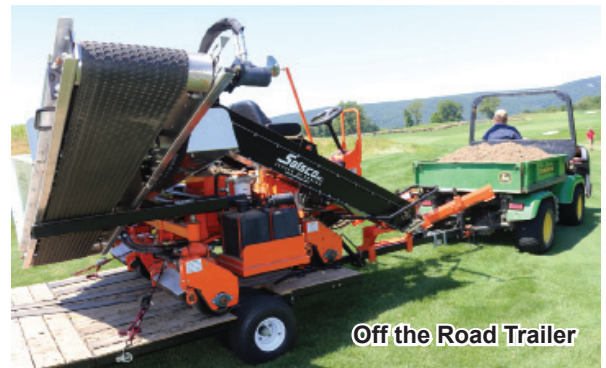
Off the Road Trailer

Over the road trailer and off road trailer.