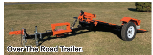
Over The Road Trailer.