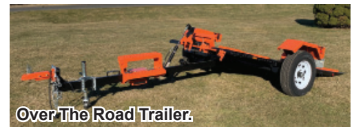
Over The Road Trailer.