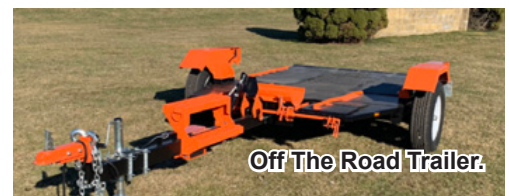
Off The Road Trailer.