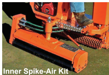
Inner Spike-Air Kit

Arm Seat Upgrade Option comfort for the operator. When using the Spike-Air Kit option on the green, it will gently spike the green to allow water and oxygen penetration through the crust to the roots of the plant. Pedal Extensions allow employees with shorter legs to remain fully seated, engaging the seat switch, while still being able to reach the pedals.