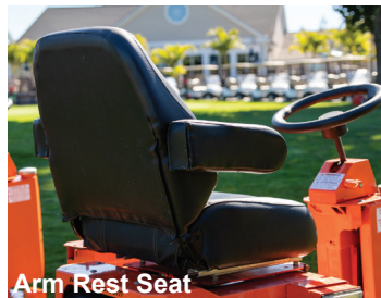
Arm Rest Seat

Brushing sand after top-dressing is easily performed with the optional Top Dressing Brush Kit , available on most Rollers. Using the Brush Kit when rolling clay courts, reduces the amount of time before play can begin.